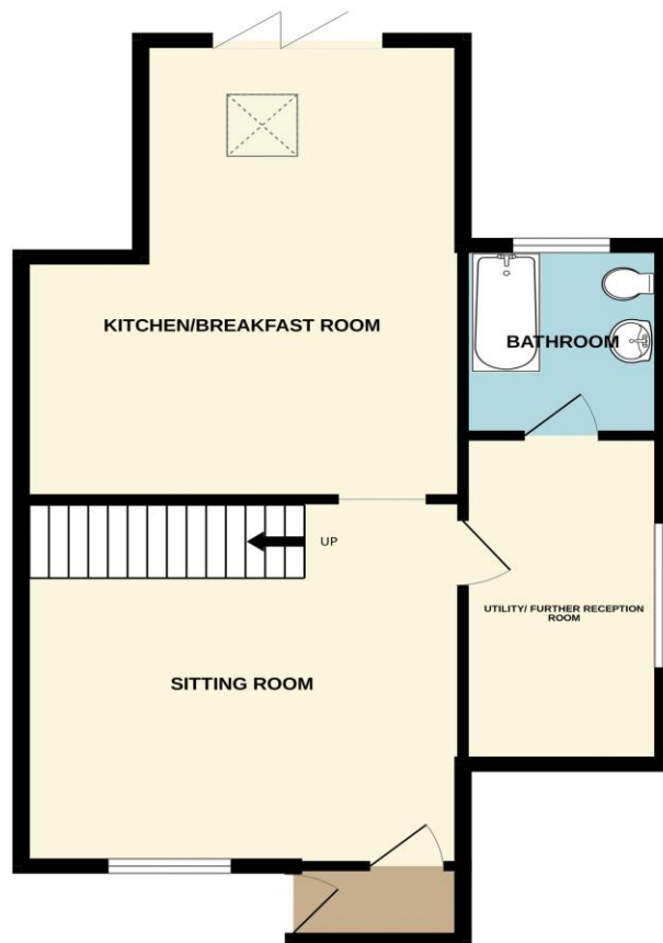
GROUND FLOOR 601 sq.ft. (55.8 sq.m.) approx.